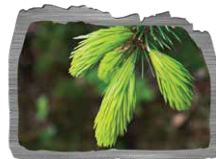
Plant from a cutting of K'iid Kiyaaas on Haida Gwaii, growing at UBC Botanical Garden.

Pine Family – Pinaceae | Conservation status: Least Concern