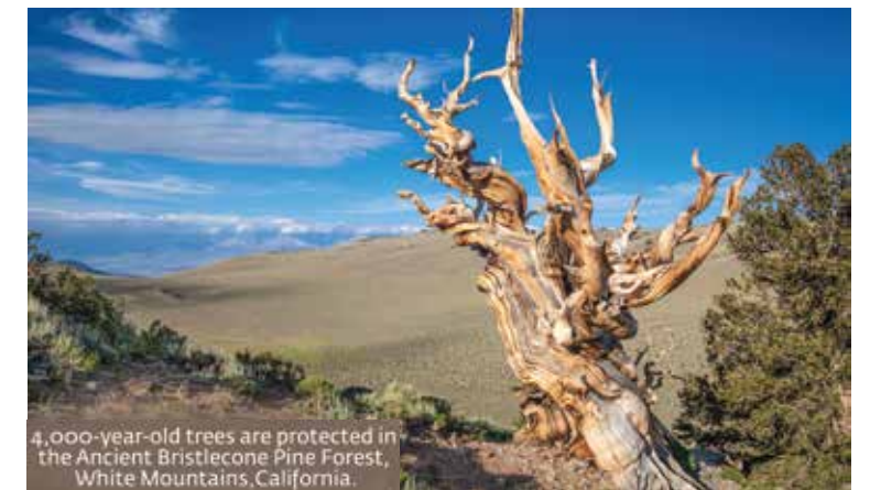
4,000-year-old trees are protected in the Ancient Bristlecone Pine Forest, White Mountains, California.