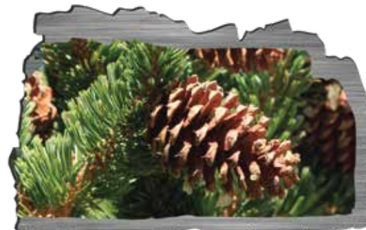
Ancient pine seed cones.