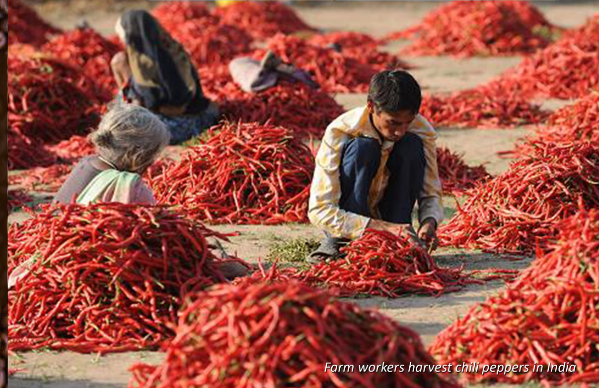
Farm workers harvest chili peppers in India

From the Old World, rice, sugar cane, bananas, grapes, citrus, coffee and more were introduced to the Americas and in turn, tomatoes, potatoes, corn, chili peppers and chocolate were brought back to the Old World.