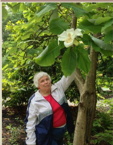
M. macrophylla – Large leaf cucumber

There are three main areas in the Garden featuring magnificent magnolias: Woodland Garden, Fern Dale and Magnolia & Hydrangea Garden. Most bloom in March but can be easily missed if do not know where to look.