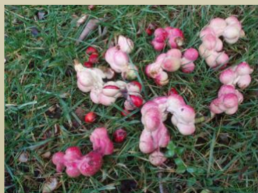
Fall treat for squirrels