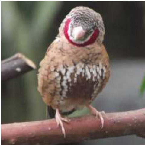
Adult male white chest colouration