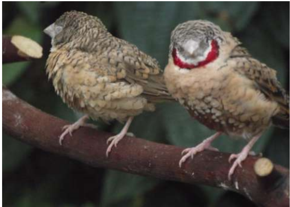
Female and male Cut-throat finches at Bloedel Conservatory

Juveniles are faded versions of their parents, with males having a duller red throat band. 4 Both sexes lack breast colour details and have dark beaks. 5