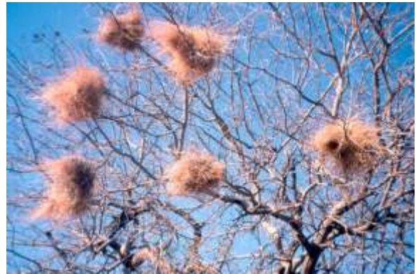
Weaver bird nests in Botswana