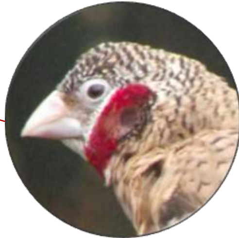
Detail showing the ear canal entrance