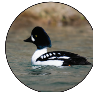
Over-wintering Birds live in the area in the winter e.g. Barrow's Goldeneye