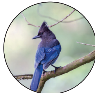
Resident Birds live in the area year-round e.g. Steller's Jay

Over 250 species of resident, migratory and over-wintering birds are regularly observed in Metro Vancouver