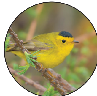
Migratory Birds live in the area in the summer e.g. Wilson's Warbler